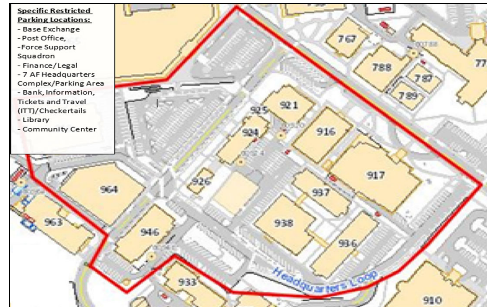
New Restricted Parking Area