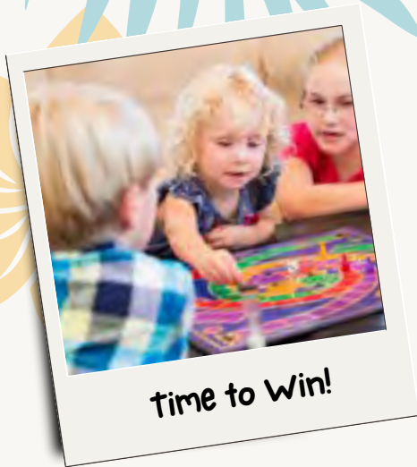
time to win!