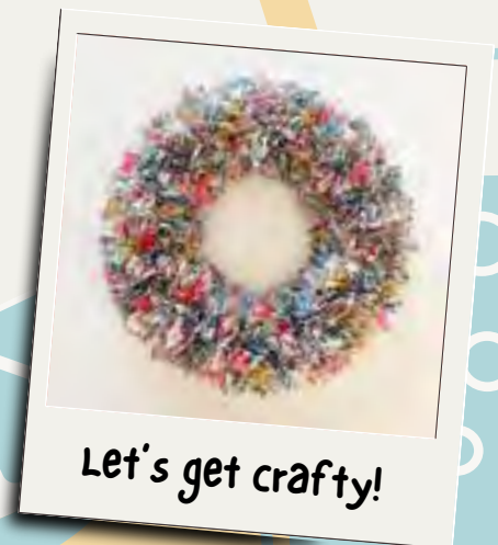
Let's get crafty!

Register or cancel by Thursday, 11 July.