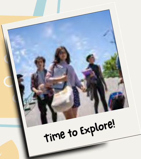
Time to Explore!