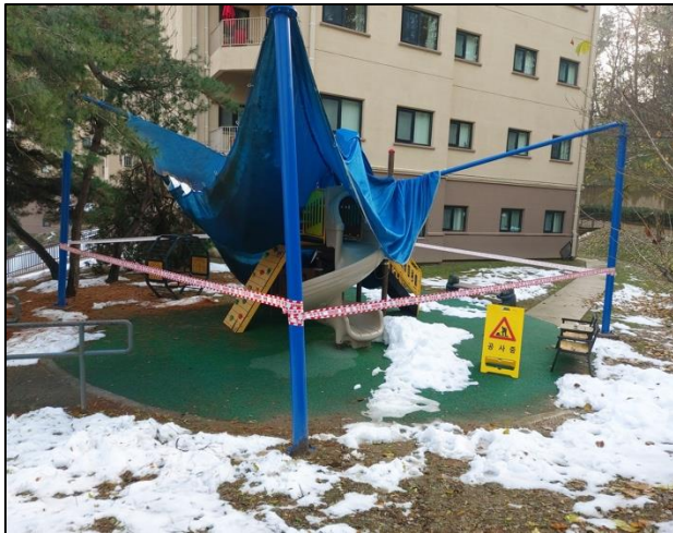
211 #2 Playground