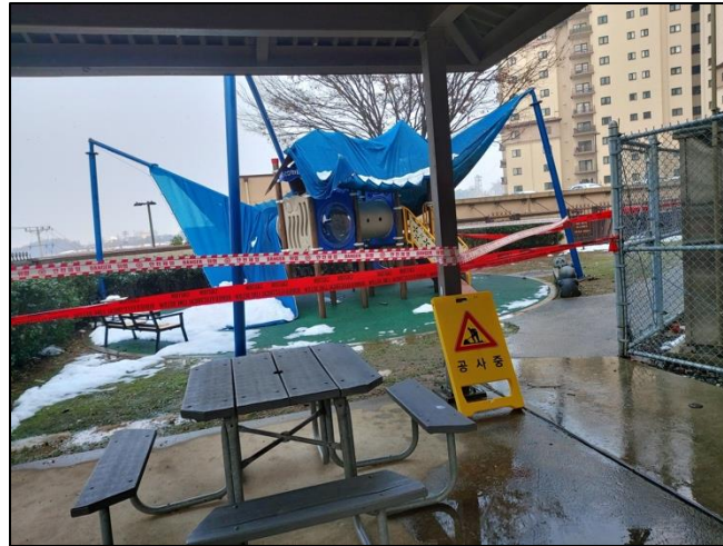
1014 #1 Playground