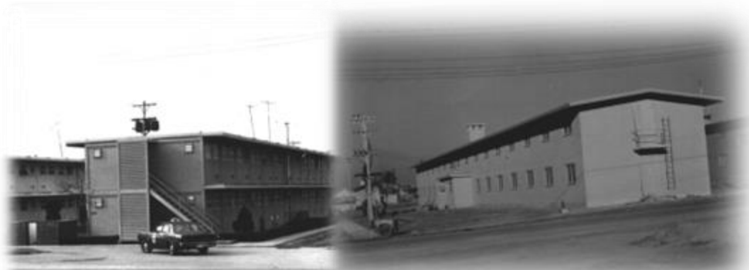
Dorm history memorabilia project