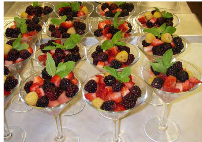
Seasonal Marinated Fruit