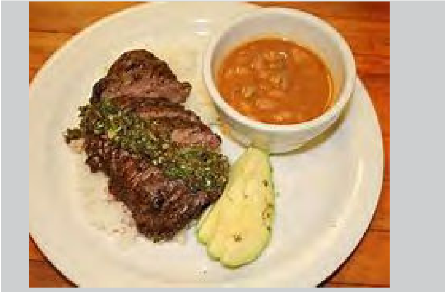
Churrasco Steak w/Chimichurri sauce

All Dinner entrees(except vegetarian) are served your choice of one vegetable, and one starch item. They also include: Fresh Garden Green Salad, Choice Dressing, Rolls and Butter, Iced Tea, Freshly Brewed Coffee and Water Minimum Guest Guarantee 25