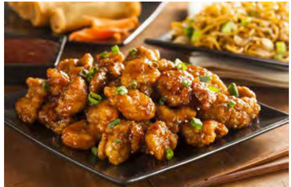
Far East Feast