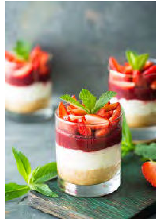
Strawberry shortcake shooter