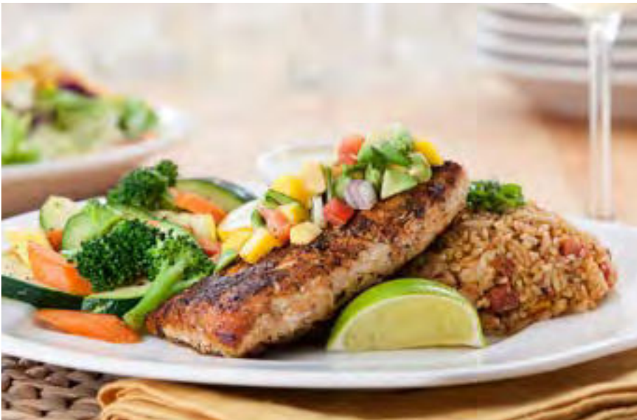
Baked Mahi Mahi