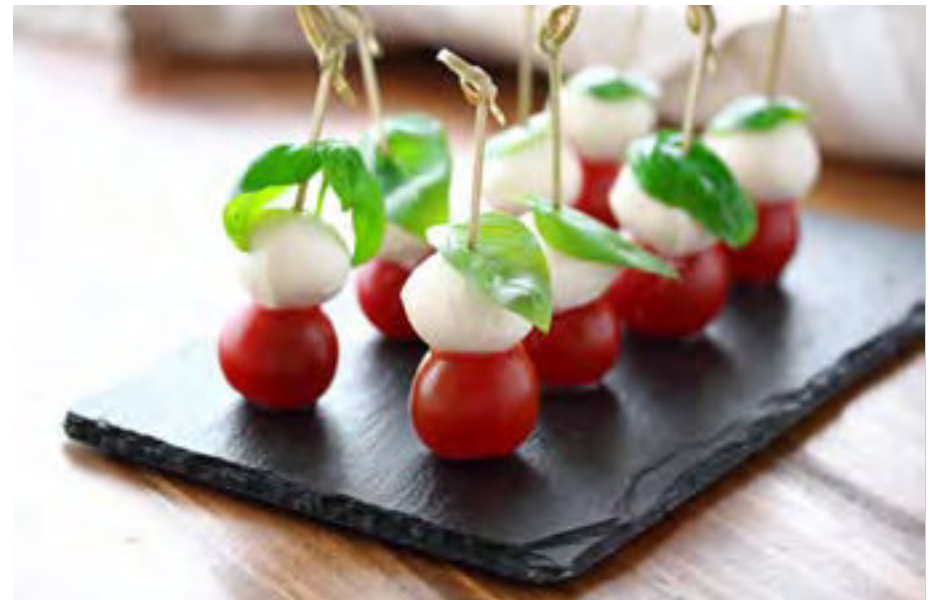
Mini Caprese Skewers