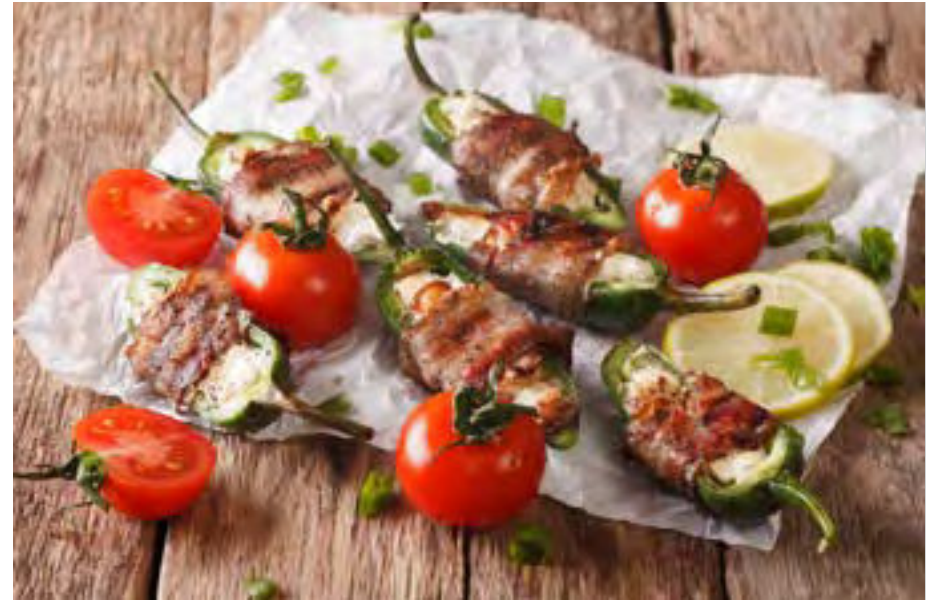
Bacon Wrapped Jalapeno