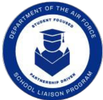
School Liaison Program